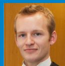
Christopher Grout Registrar Qatar International Court and Dispute Resolution Centre